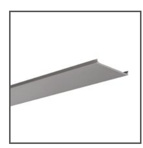
MASKING COVER MP-50 C28263L01_1, C28263L10_1, C28263L07_1 Ref. arch 17172, 17172L9010, 17172L9005