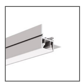
FOLED-BOK A08334V1 Ref. arch B8334V1