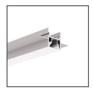
FOLED A08332V1 Ref. arch B8332V1