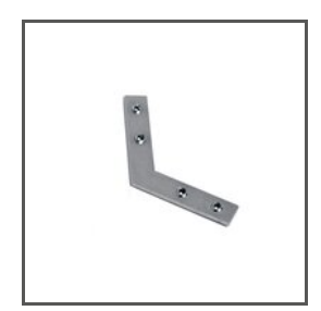
CONNECTOR ZM-NA-120 C28242N00 Ref. arch 42729