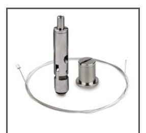
FASTENER SET RD-2 C28232P00, C28232P01, C28232L10, C28232L07, Ref. arch 42653NI, 42653GS, A2653L9010, 42653L9005