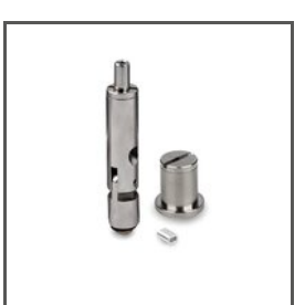
FASTENER SET RD-4 C28234P00, C28234P01, C28234L10, C28234L07 Ref. arch 42657NI, 42657GS, 42657L9010, 42657L9005

C28233P00, C28233P01, C28233L10, C28233L07 Ref. arch 42659NI, 42659GSS, 42659L9010, 42659L9005