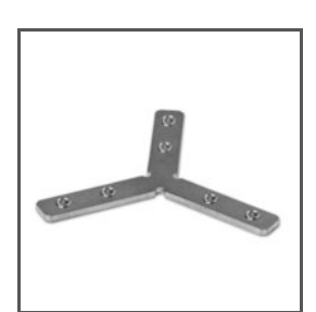
CONNECTOR ZM-Y120-G 42336