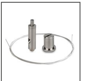
FASTENER SET RD-1 C28231 Ref. arch 42658NI, 42658GSS, 42658L9005, 42658L9010