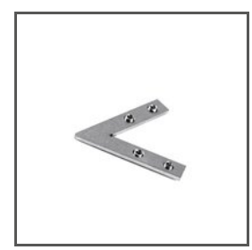
CONNECTOR ZM-60 C28243N00 Ref. arch 42736