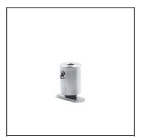
FASTENER FI-10-ZM-W C28116N00 Ref. arch 42242