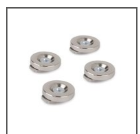
MOUNTING BRACKET K-10 C24340C00 Ref. arch 24340

FASTENER SET NEO-ZM-3 C28105N00 Ref. arch 42127