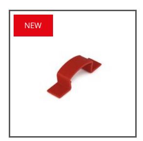
CLIP HR-MAX C28059C00 Ref. arch 24416