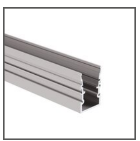
HR-MAX-TW A01828 Ref. arch C1828