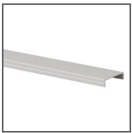
PROTECTIVE INSERT TECH-35 C24534C02 Ref. arch 17127