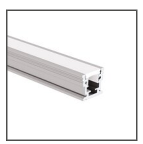
HR-MAX A01829 Ref. arch C1829