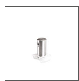
FASTENER K-10-WL C28237N00 Ref. arch 43673