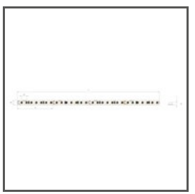
K-1091-24V K-1091-24 Ref. arch K-1091-24V