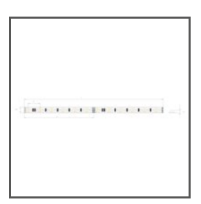
K-1560-RGB-24V K-RGB-1560-24 Ref. arch K-1560-RGB-24V