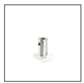
FASTENER K-10-WP C28236N00