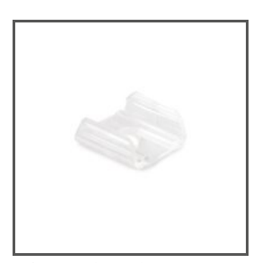
MOUNTING BRACKET K-10 C24340C00 Ref. arch 24340