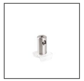
FASTENER K-10-PP C28235N00 Ref. arch 42670